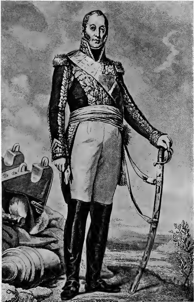
ADOLPHE ÉDOUARD MORTIER, DUKE OF TREVISO FROM AN ENGRAVING AFTER THE PAINTING BY LARIVIÈRE